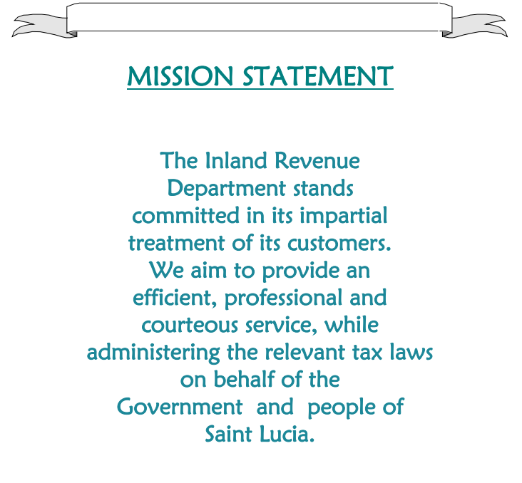
NOTE This Pamphlet provides only basic information.